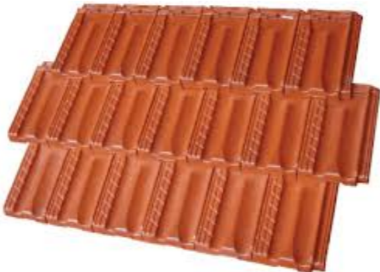
Monier Cottage Red Marseille terracotta tiles