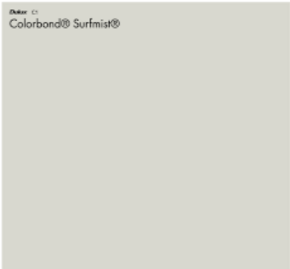
Colourbond Surfmist windows and fascias