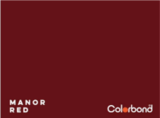
Colourbond manor red gutters and down pipes